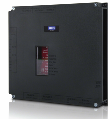
pivCLASS® Authentication Module (PAM)