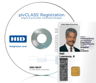
pivCLASS® Registration Engine & Certificate Manager